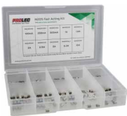
Assortment Fuse Kits (see p24)