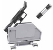
Fused Terminal Blocks (see p146)