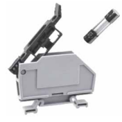
Fused Terminal Blocks (see p146)