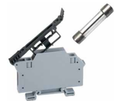
Fused Terminal Blocks (see p.146)