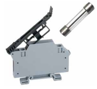
Fused Terminal Blocks (see p146)