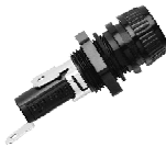
PCB & Panel Mount Fuse Holders (see p117-120)