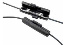
Inline Fuse Holders (see p121-122)