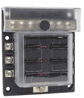
6 Way Fuse & Ground Panel with Separate Clear Covers

Screws & Lock Washers: Included. Mounting Screws: Included.