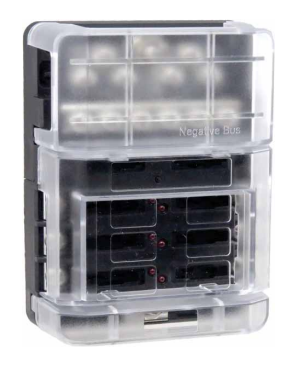
6 Way Fuse Panel With GTP and Clear Fuse / GTP Covers